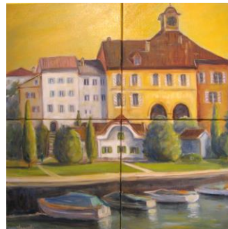
Three paintings by Rita Mancesti